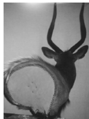
FIG. 3. AT THIS POINT IT IS UP TO YOUR CREATIVITY TO SCULPT THE BACKSIDE OF THE TROPHY, OR SIMPLY POSITION ON THE “ SWING ARM WALL KIT ”

FIG. 2. ATTACH MOUNTING PLATE TO BACKSIDE OF MANIKIN. MOUNT FLAT PLATE AGAINST BACK BOARD WITH TUBE OUTWARD, OR CUT A GROOVE SLIGHTLY WIDER THAN THE TUBE. RECESS THE TUBE SIDE INTO THE MANIKIN. USING 1 SCREW TO ATTACH TEMPORARILY, LEVEL THE ANIMAL. ONCE LEVEL, TIGHTLY ATTACH MOUNTING PLATE WITH THE REMAINING SCREWS (1 1/4” pan head screws provided). BE SURE TO EXTEND TUBE AT LEAST 1/4” BELOW BRISKET TO ALLOW FOR SKIN AND HAIR WHEN MOUNTED.