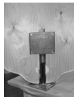
FIG. 2. ATTACH MOUNTING PLATE TO BACKSIDE OF MANIKIN. MOUNT FLAT PLATE AGAINST BACK BOARD WITH TUBE OUTWARD, OR CUT A GROOVE SLIGHTLY WIDER THAN THE TUBE. RECESS THE TUBE SIDE INTO THE MANIKIN. USING 1 SCREW TO ATTACH TEMPORARILY, LEVEL THE ANIMAL. ONCE LEVEL, TIGHTLY ATTACH MOUNTING PLATE WITH THE REMAINING SCREWS (1 1/4” pan head screws provided). BE SURE TO EXTEND TUBE AT LEAST 1/4” BELOW BRISKET TO ALLOW FOR SKIN AND HAIR WHEN MOUNTED.